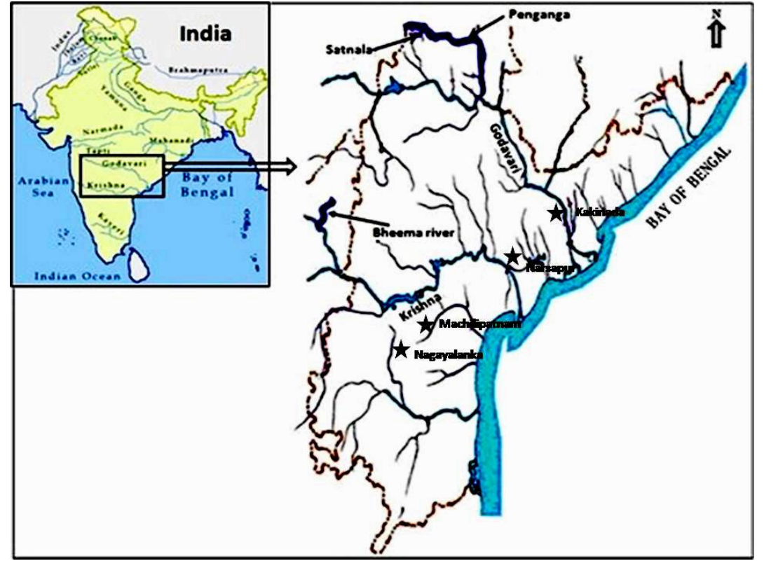
Fig. 1.A map representing the four sampling sites (marked with star) in coastal Andhra Pradesh within Krishna and Godavari delta which is a representative sampling map used for the study.

Our findings called for a more careful evaluation of pathogenic strains of V. parahemolyticus focusing on antimicrobial drug resistance due to the high consumption of farmed fish in coastal areas. Simultaneously identifying V. parahemolyticus isolates exhibiting virulence and multidrug resistance is a public health issue. Evolutionary trends favoring hybrids of pathogenic and resistant strains result from this persistent selective pressure. Thus, it is important to conduct proper antimicrobial susceptibility testing, including molecular characterization of these strains frequently in fish farming. Multiple antibiotic resistance was seen in some of the V. parahemolyticus isolates tested here. Effective prevention or treatment of V. parahemolyticus -induced illness requires an accurate and clear understanding of antibiotic-resistance trends in aquaculture.