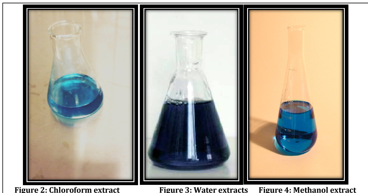
Figure 2: Chloroform extract

Extraction of Selected Camellia sinensis was prepared by using leaves (10.66 kg), different solvent water, pet ether, chloroform and methanol. The yield of extract was found to be 8.3%, 3.1%, 8.3% and 7.6 % respectively. The results of yield of extract indicated that highest bioactive components present in water, chloroform and methanol extract. These extract may have potential therapeutic activities.