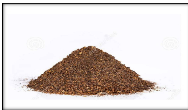
Figure 1: Camellia sinensis powder