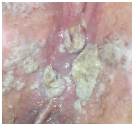
Fig4: Wart lesions in the perinea