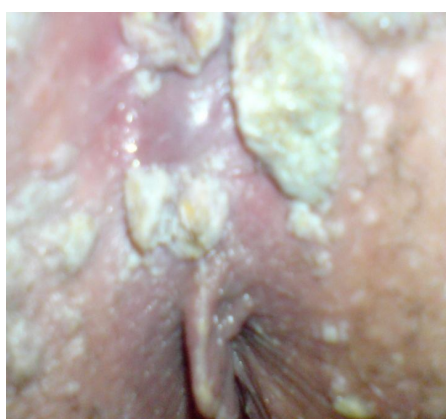
Fig3: Wart lesions in the perinea