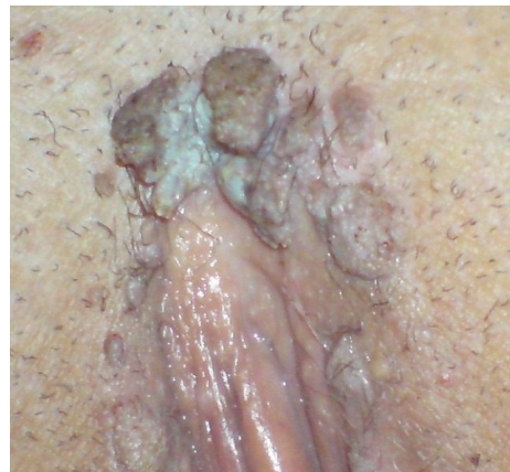
Fig2: Wart lesions in the vagina and clitoris