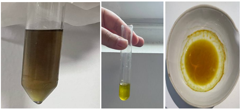
A. (+) (terpenoids) test B. (+) flavonoid test C. (+) alkaloid test Fig (1): Tests for (A) terpenoids, (B) flavonoid (C) alkaloid.